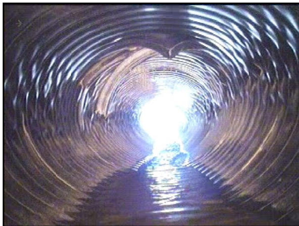
Figure 3: HDPE pipe