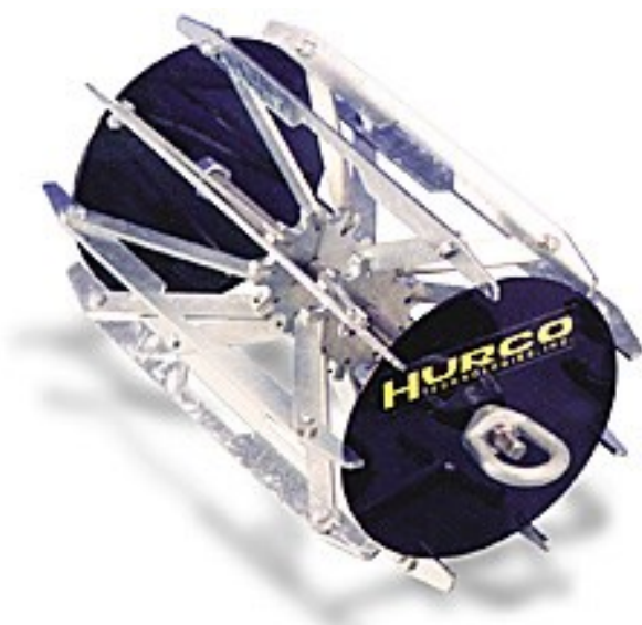
Figure 2: Mandrel, used for deflection testing

The Post-Installation Inspection Guide answers all of the questions above. This guide is a compilation of best practices from AASHTO, American DOT's, and other agencies across the United States. A task group was formed with the sole purpose to improve post installation inspection in America. The task group scoured numerous specifications and best practices in order to produce the guide. The following bullets are from the guide: