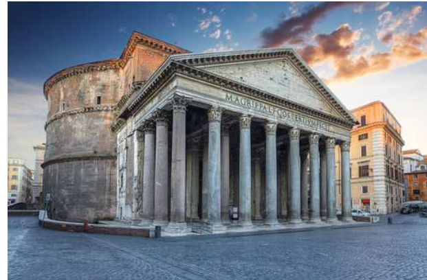
Figure 1: The Pantheon of Rome. This ancient concrete structure was originally constructed in 126AD.

Through proper design and curing, concrete can be considered one of the most durable building materials in existence. Concrete structures typically have a design life of 100 years; however, countless examples of ancient concrete structures are still erect today. Concrete is inherently strong under compressive stresses but weak in tension. This is why most concrete structures have embedded reinforcement to resist these tensile forces, typically in the form of steel wire/rods. Some cracking is normal and usually accounted for in a design. This just implies that the tensile forces have exceeded the concrete's strength capacity and the force is getting transferred to the steel reinforcement.