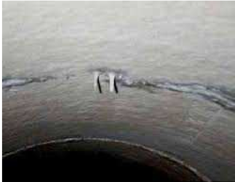
Figure 3: Calcium carbonate crystals have completely formed over an existing crack in this concrete pipe.

Autogenous healing of concrete occurs when the continuity between two sides of a crack is restored without repair work. According to the Concrete Society, based in the UK, “Autogenous healing is the natural process of crack repair that can occur in the presence of moisture and the absence of tensile stress” [2]. The formation of calcium carbonate crystals. \text{CaCO}_3 is the primary cause for the self-healing of cracks.